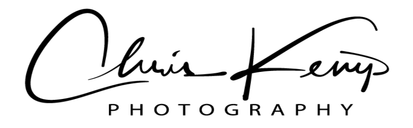
Pricing & Information